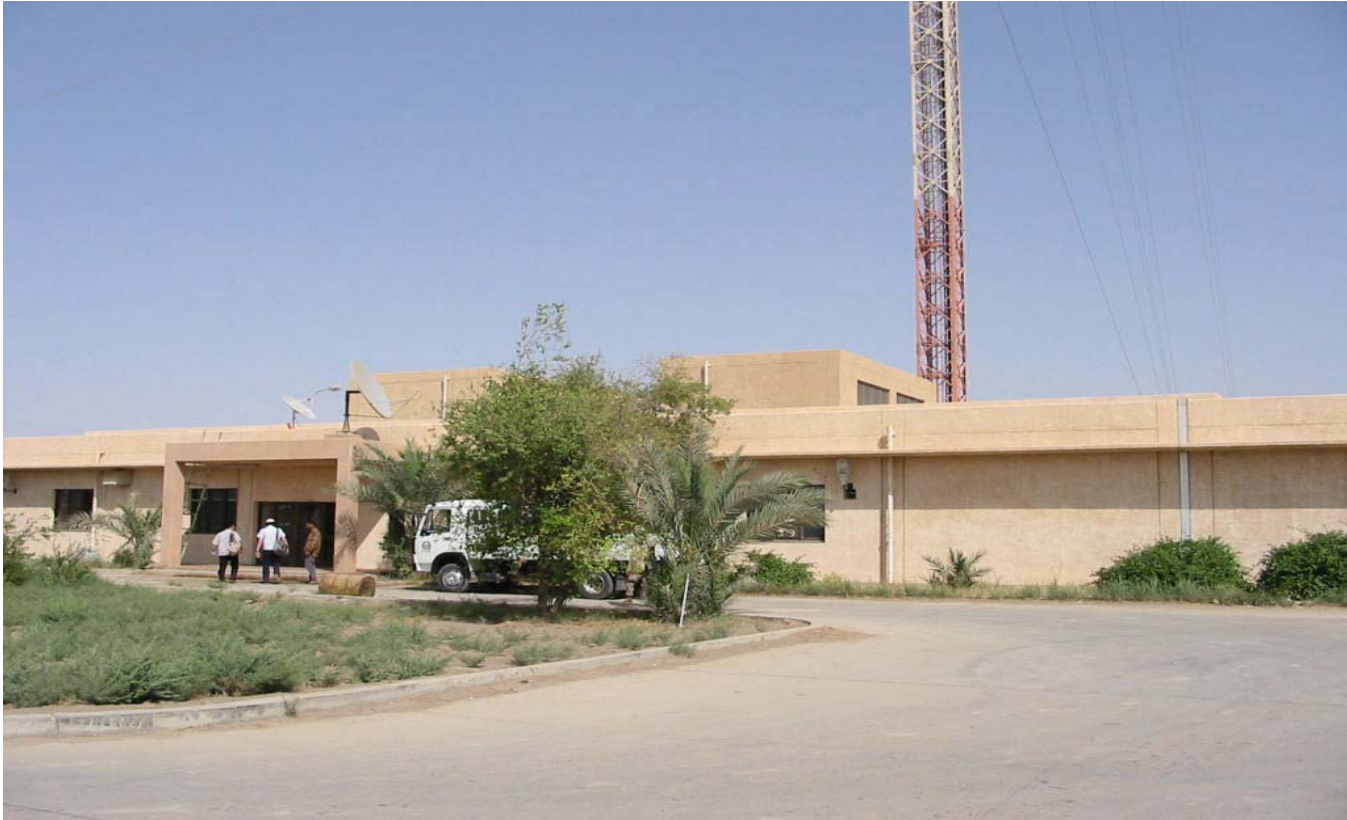
Hilla TV Centre